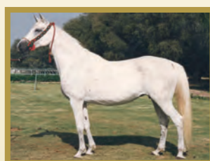
Al Kaheela Al Zarga (1976, EAHS Vol. 1)