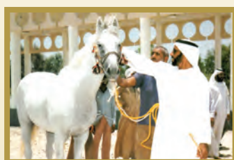
The late Sheikh Zayed bin Sultan Al Nahyan

Volume 1 of the studbook saw the registration of 318 horses, 213 of which belonged to the late Sheikh Zayed bin Sultan Al Nahyan, and the total number of owners was only 21 at the time. Now however, the EAHS registers more than 1,400 horses annually, and there are more than 26,000 registered Arabian horses and 5,000 owners. In addition, the EAHS arranges a very busy calendar of activities including halter shows, race meetings and endurance events, as well as seminars, auctions and exhibitions.