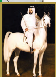
The late Sheikh Zayed bin Sultan Al Nahyan