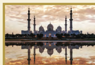
Sheikh Zayed Grand Mosque

When the late Sheikh Zayed bin Sultan Al Nahyan laid the solid foundations for this activity, his goal was not only having a Studbook and Registry for recording horse lineages. His aims went much further than that, as he wanted to preserve and promote these purebred Arabian horses in the world, and during his lifetime, Horse Shows and Race meetings around the world received his generous sponsorship. This continues in his name today led by His Highness the President's Cup Award, which has encompassed important capitals all over the world for more than 30 years, in addition to the His Highness Sheikh Mansour bin Zayed Al Nahyan Racing Festival, which includes more than 150 races around the world. The initiative of His Highness Sheikh Mansour bin Zayed Al Nahyan, represented by the Emirates Arabian Horse Global Cup, was recently launched, which was specifically designed to support smaller breeders around the world.