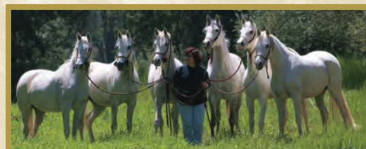
Princess Alia with broodmares of the Royal Stables