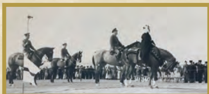
HM King Abdullah of Transjordan