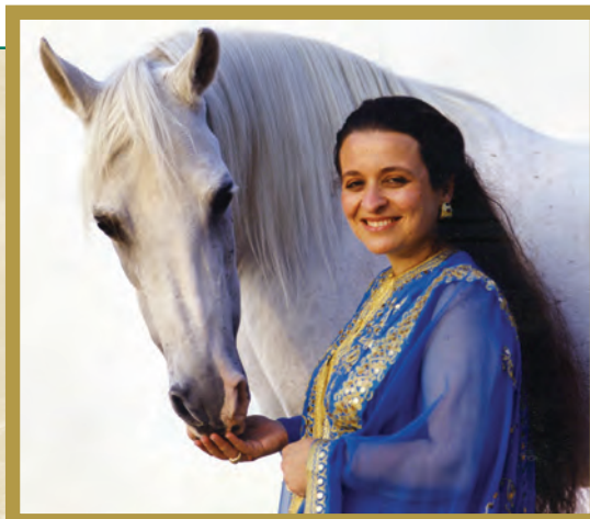
Princess Alia and Aziza

Dear WAHO Members, Friends and fellow lovers and caretakers of the Arabian horse, It gives me great pleasure to invite you to attend the WAHO 2021 Conference to be held in Amman, Jordan.