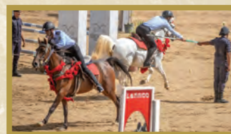
Ceremonial Guard Mounted Display

Arabian horses have been an integral part of Jordan's culture and history since time immemorial, and we are very proud that in this modern age we still have so many excellent representatives of the very qualities for which our local Arabian horses were famous. During the Conference week, we plan to showcase some of our horses in a special Parade. We will also offer a variety of tailor made tours, including visits to Stud farms and the Al Ma'wa Reserve for Nature and Wildlife. We will do our utmost to ensure that during your time with us here in Jordan you will enjoy our traditional Jordanian hospitality to the full.