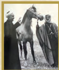
HM King Hussein of Jordan at the Royal Stables