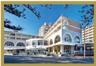
Crowne Plaza Hotel, Terrigal